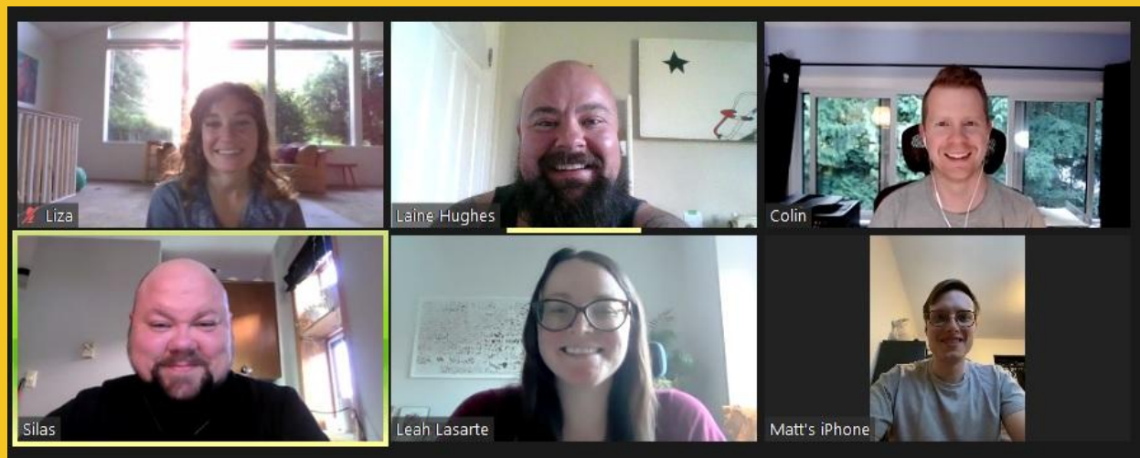
Above: Just another VTL Board Meeting, zoom-style.